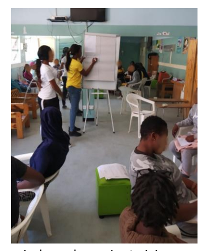
Ambassadors enjoy training activities, Mazowe, July 2019

Prior to the OPTIONS training, the Mazowe ambassadors had received training on HIV transmission and prevention methods, including basic information on oral PrEP. However, the OPTIONS training provided more comprehensive information on oral PrEP as part of combination prevention and focused on improving peer navigation, action planning, and advocacy skills. For example, during the training, ambassadors identified the main barriers to oral PrEP uptake in Mazowe and strategized a plan to address these barriers as a team.