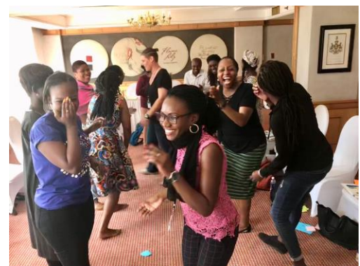
Having fun testing the boundary setting activity during the prototype review, Harare, April 2019

Finally, organizations or groups planning to implement an ambassador program – or who would like to supplement their existing ambassador training with all or selected portions of the OPTIONS manual – should have a plan in place to provide