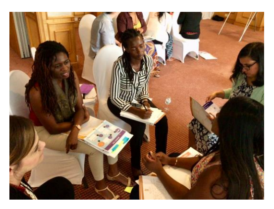
Training package prototype review, Harare, April 2019

The OPTIONS HIV Prevention Ambassador Training is tailored to reach peer HIV prevention ambassadors, who are typically adolescent girls and young women between the ages of 15-24. The training is primarily intended to help AGYW remain HIV negative, but many of the skills introduced and reinforced through the training could be used by ambassadors to support healthy behavior and decision-making by all AGYW, including those who are HIV-positive.